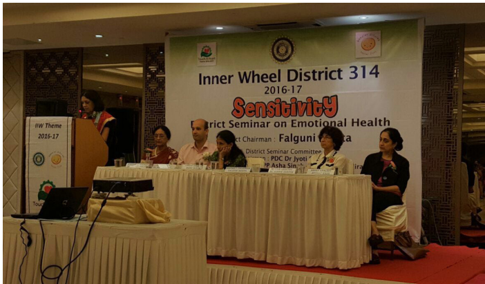
Members of Inner Wheel and PTRC at the Seminar on 'Emotional Health' in Mumbai.

understanding and reach out to people in need of emotional health from different socio-economic strata.