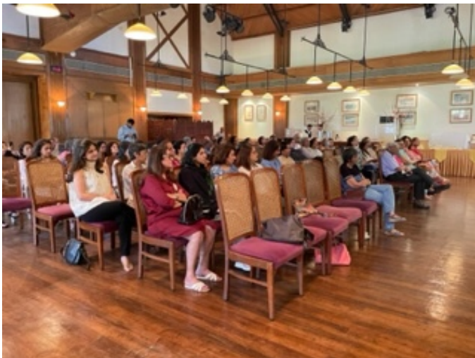
Audience immersed in the discussion that followed the screening.