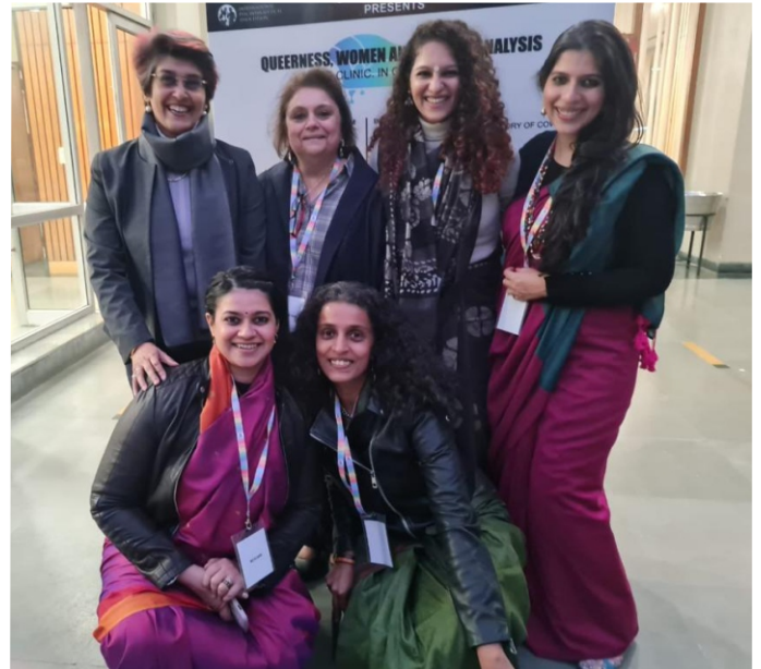
COWAP committee members at the Delhi Conference